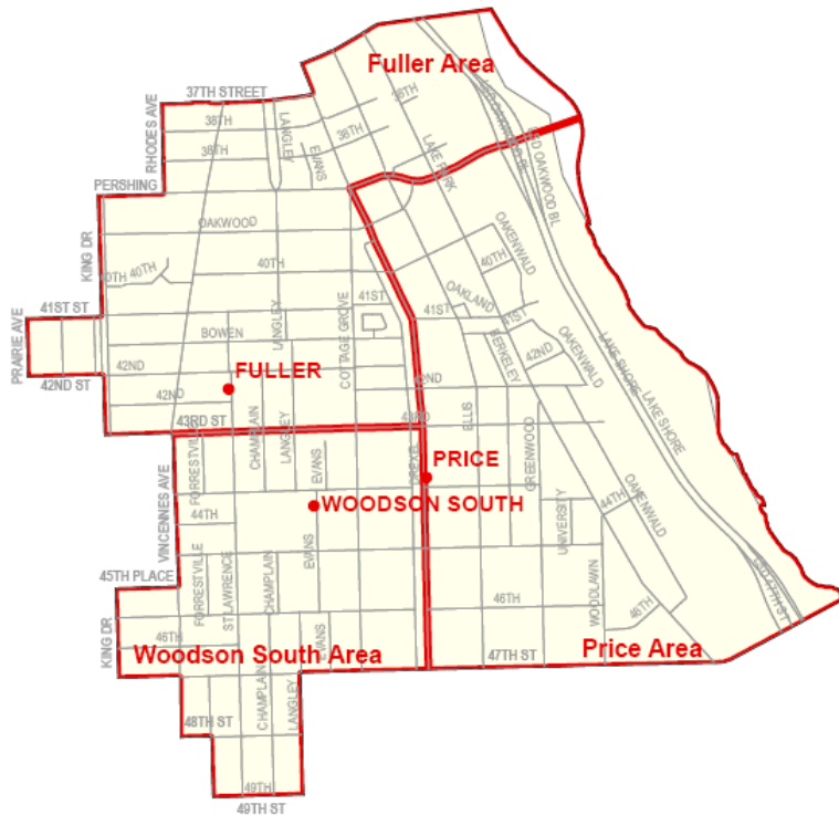
Current 2011-12 Boundaries