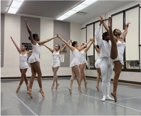
Journey of the Brown Tights 2/25/26