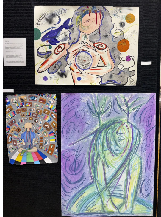
Sophomore Visual Art Showcase (3/6/26)